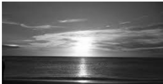
Beyond, the sunset ...

"And he shewed me a pure river of water of life, clear as crystal, proceeding out of the throne of God and of the Lamb. In the midst of the street of it, and on either side of the river, was there the tree of life, which bare twelve manner of fruits, and yielded her fruit every month: and the leaves of the tree were for the healing of the nations. And they shall see his face; and his name shall be in their foreheads. And there shall be no night there; and they need no candle, neither light of the sun; for the Lord God giveth them light: and they shall reign forever and ever" (Revelation 22:1-5).